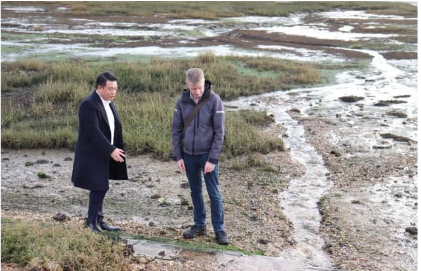
Alan Mak MP with Graham Horton from Natural England at Langstone Mill Pond

Over the past year Mr Mak has championed the views of local residents and community groups and called on key local decision-makers to work together to come up with a solution to protect the Mill Pond and neighbouring assets such as the nearby footpath.